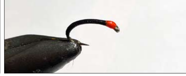
Snake. Can't be ignored! They nearly always work - pulled, static, drifted, on the drop in the surface, deep. I like the chain bead head as it creates movement on the drop. Black is the best all round colour.